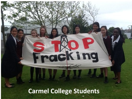
Carmel College Students

What quote, prayer, thought or mantra will you take with you as a reminder?