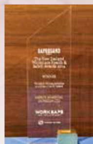
MERCY Hospital's workplace health and safety award, presented for its smoke-free theatres.

Theatre staff at the hospital report an improvement in air quality and better visibility of the surgical site. They report a sense of improved wellbeing, with a reduction in headaches and respiratory conditions.