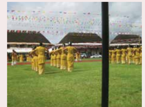
STUDENTS of Paul VI College dance the Sāsā in ceremonies before the opening of the new Catholic cathedral in Apia on May 30.