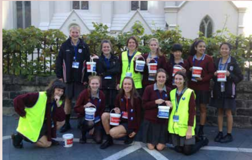
WITH their hospice appeal buckets handy, Year 11 students from Carmel College wait outside St Patrick's Cathedral in Auckland for midday Mass. The girls raised over $3000 for Mercy Hospice Auckland on their service day venture.

"And hopefully, as they saw themselves reflected in the shop windows as they stood outside to collect for hospice, they saw Christ in themselves, as they too served others through their actions."