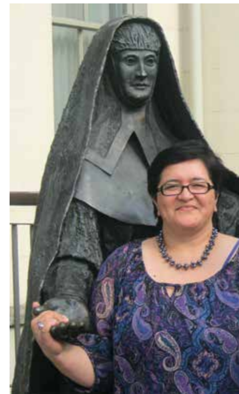
BAGGOT St pilgrim.... 'permitted to be a Mercy woman'

"But the definition of poverty in New Zealand is different. This involves children who aren't guaranteed new shoes or a raincoat as winter starts, who can't count on warm housing or school lunches, whose parents struggle to find enough money to