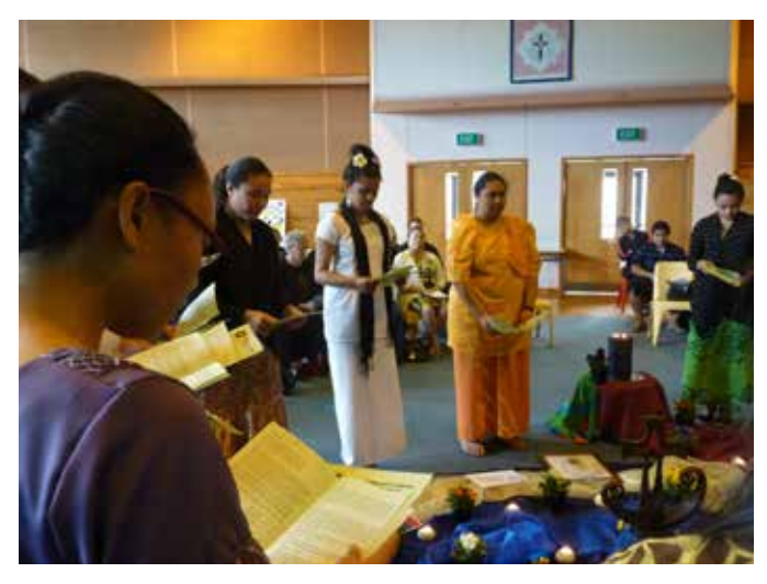
FLASHBACK: Mercy Young Adults at their commissioning ceremony last year .., "we'd heard so much about the group that I jumped at the chance to join up."

We listened to presentations by an environmental group, concerned with what is happening to life on Earth. We were shocked, as we witnessed the devastation being done to the planet by the way of life humans are pursuing. Mother Nature is being destroyed and God's creation ruined, because of the choices we make.