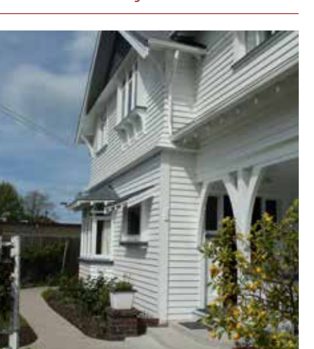
RELOCATED: The new premises for Rosary House Spiritual Life Centre, at 22 Gracefield Ave in Christchurch.