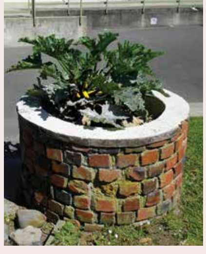
Clockwise from top left: Setting the table for Sharing Feed; a welcoming entrance the Hub's reception; play room for children; a zuchinni to feed South Dunedin!; the vegetable garden.

The Hub's flier; but passing by the lush garden or attracted by the delicious aroma of home cooking can be enough to entice families to engage with the project.